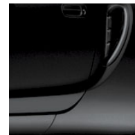
Black with Gray or Black fabric or Black leather interior